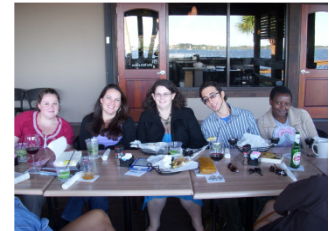
November Book Club Attendees